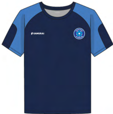
CUT AND SEW

Choosing one of our premium leisurewear ranges is just the beginning - each theme can be expanded upon to create a truly unique design. Choose between our cut & sew, part-sublimated and fully sublimated options for a leisurewear range that is perfectly suited to you.