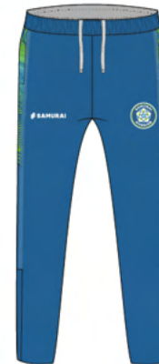
TAPERED TRACK PANT