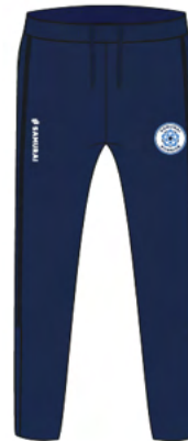
U: 0200 TAPERED TRAINING PANT