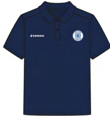
EP: 0111 PERFORMANCE POLO 2.0