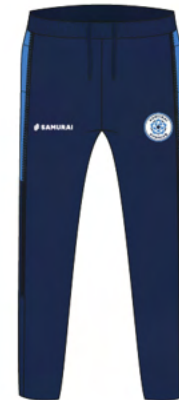
TAPERED TRACK PANT