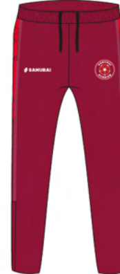
TAPERED TRACK PANT