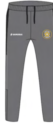
TAPERED TRACK PANT