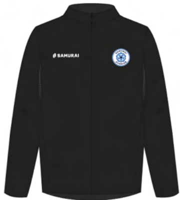
EP: 0102 REVOLUTION TRACK TOP 2.0