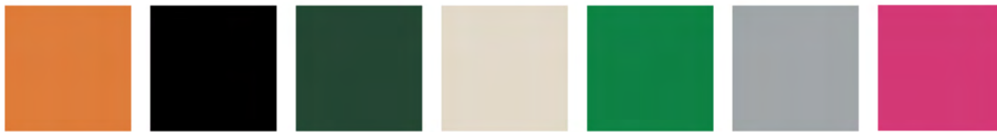
AUS GOLD 01